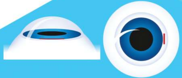
Incision shapes, side and topview